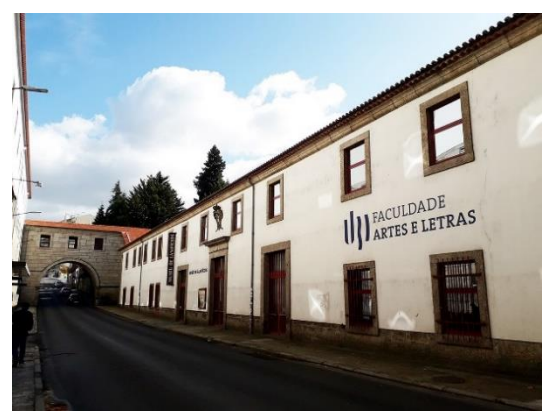
Faculty of Arts and Letters