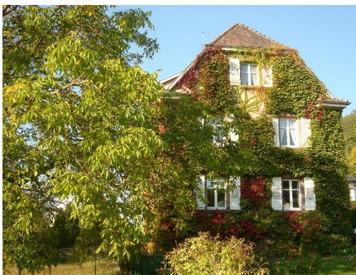
Albert Schweitzer House in Gunsbach