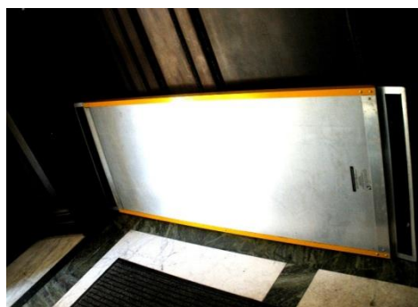
Mobile Ramp to be used for entry – stored in lobby