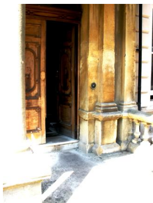
Main entrance to Cotham House