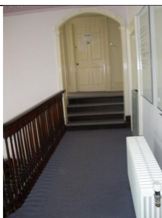
First floor landing