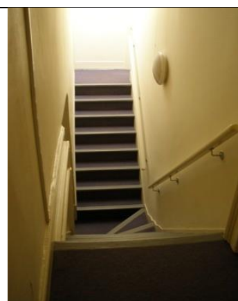
Staircase from second floor to first